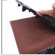
Sandpaper Punching tool