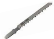
Wood Cutting Blade

All specifications subject to change without prior notice. All models and accessories subject to stock on hand.